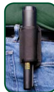
Belt holster included!