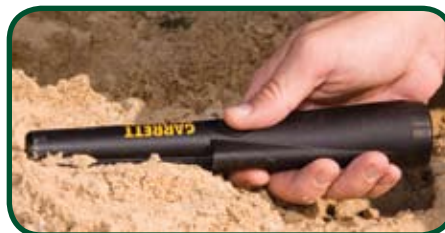
Scraping blade for searching soil