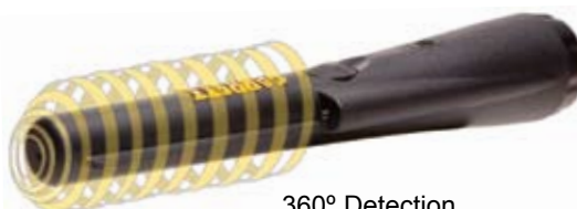
360° Detection with Tip Pinpointing