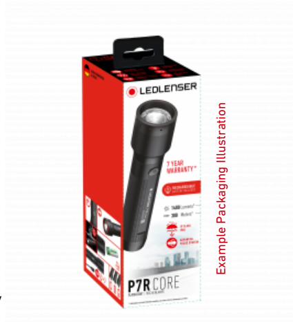
Example Packaging Illustration